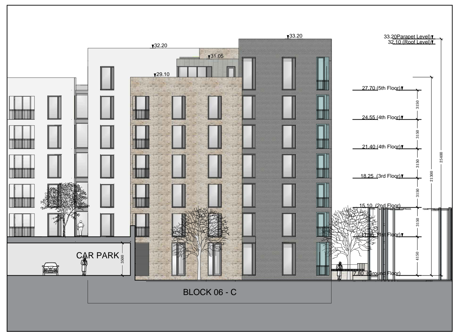
B06 - C - SOUTH ELEVATION Scale 1:200