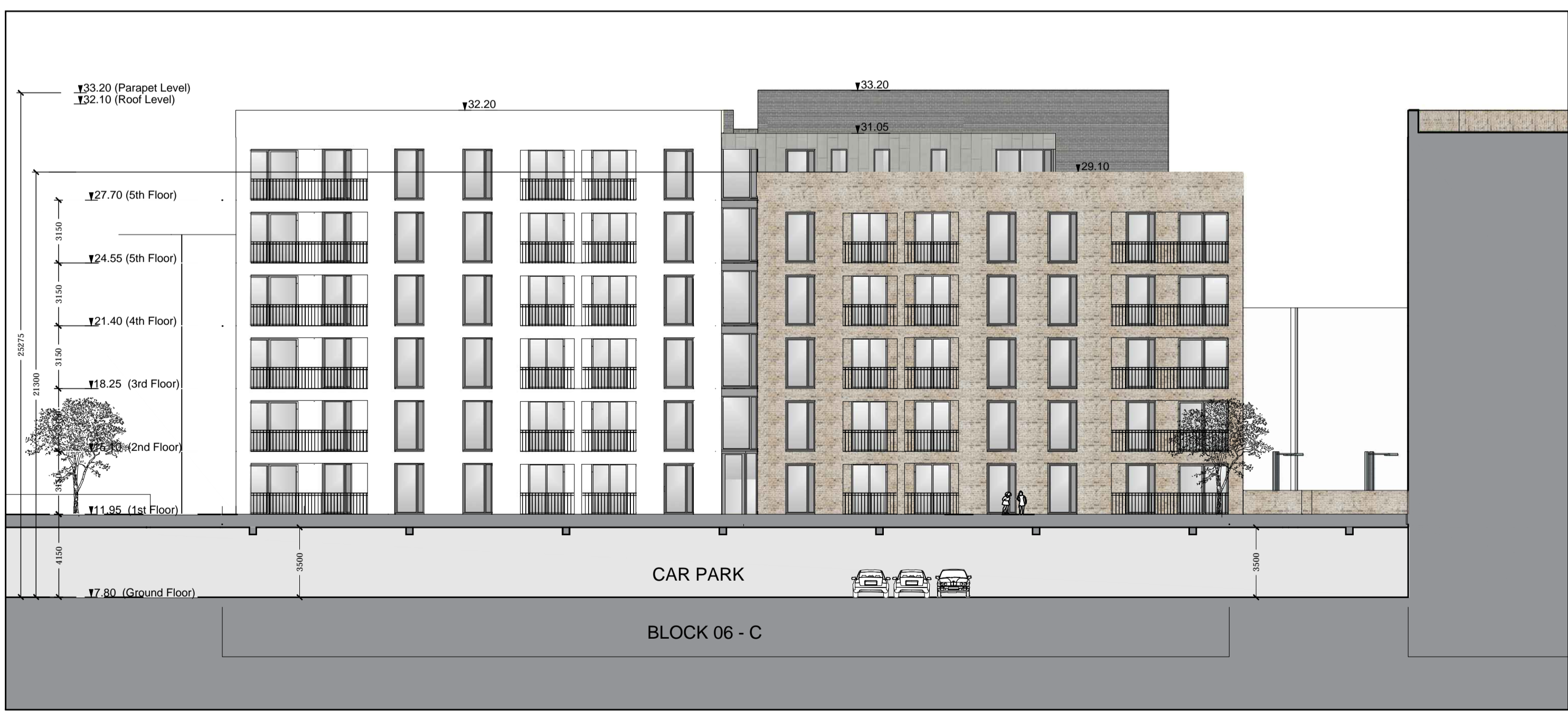
B06 - C - NORTH ELEVATION Scale 1:200