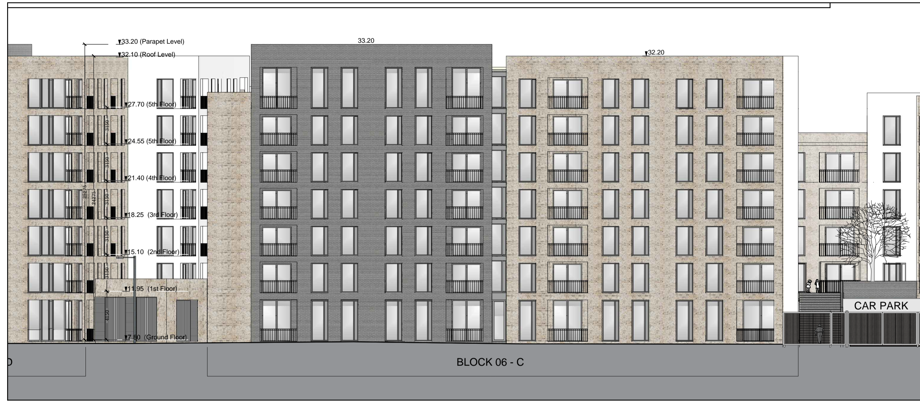
B06 - C - EAST ELEVATION Scale 1:200